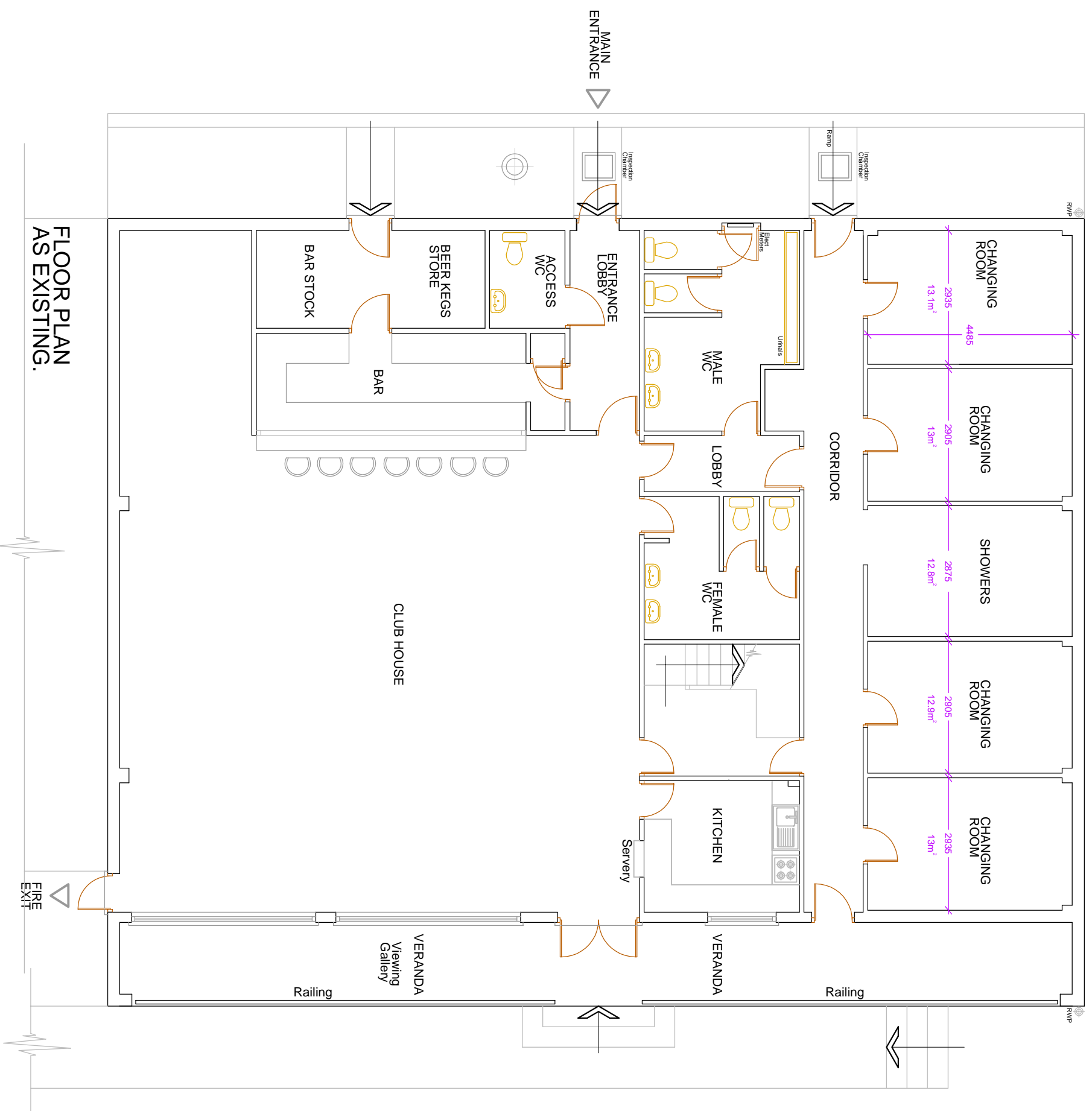
FLOOR PLAN AS EXISTING.